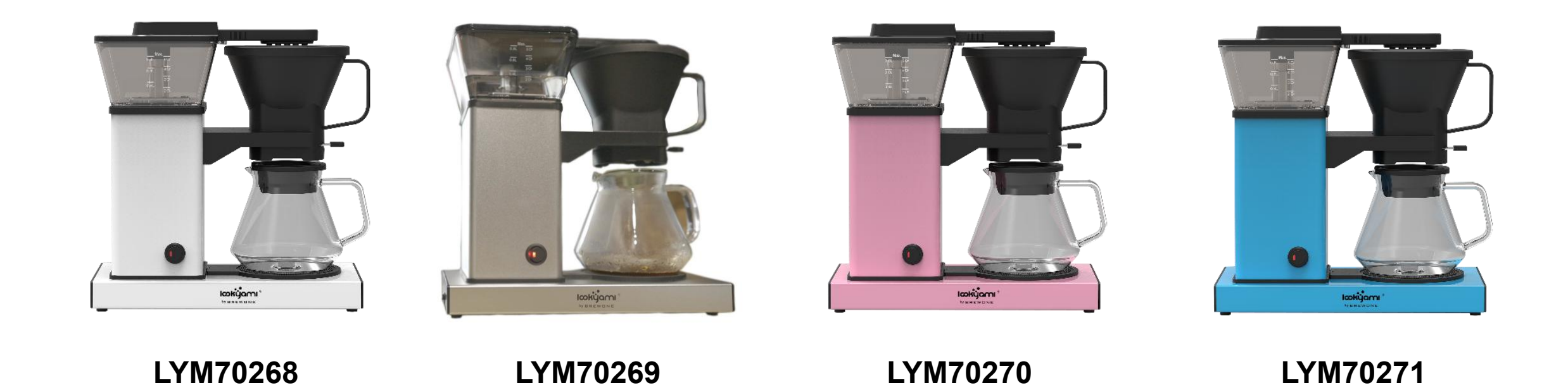
Four Colors for Option